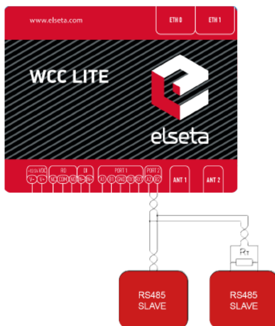
Figure 8: Typical WCC Lite RS-485 connection diagram

WCC Lite 3-wire RS232 interface is available on PORT1 and can be selected by the user (see Port settings). Baud rates up to 115200 are supported. See the typical RS232 connection diagram in figure 9.