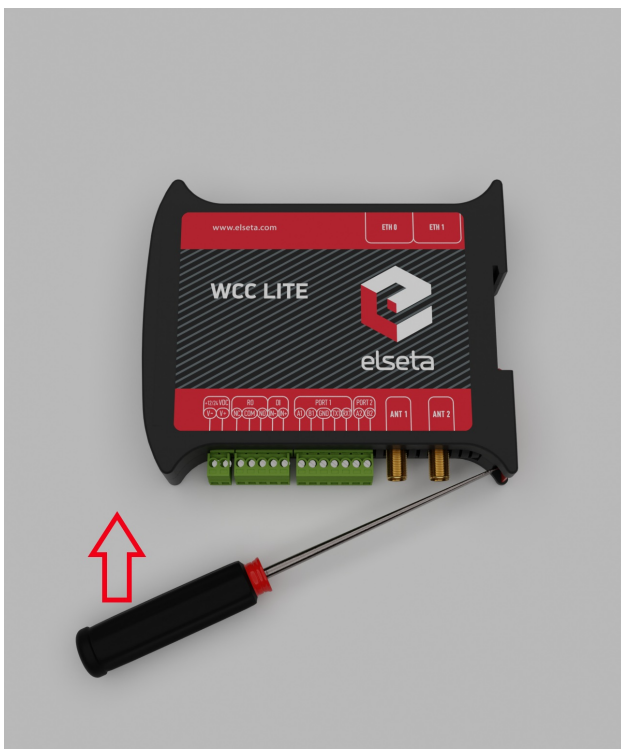
Figure 2: WCC Lite DIN rail mounting clip