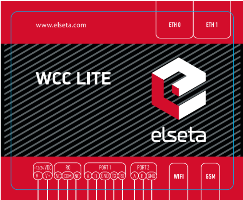
Figure 1. Wi-Fi antenna connector (hardware version older than 1.4 )

For hardware versions older than version 1.4 , in case a Wi-Fi connection is needed, connect a Wi-fi antenna to the SMA connector labeled “WIFI”. Select a good antenna placement spot considering the operation environment.