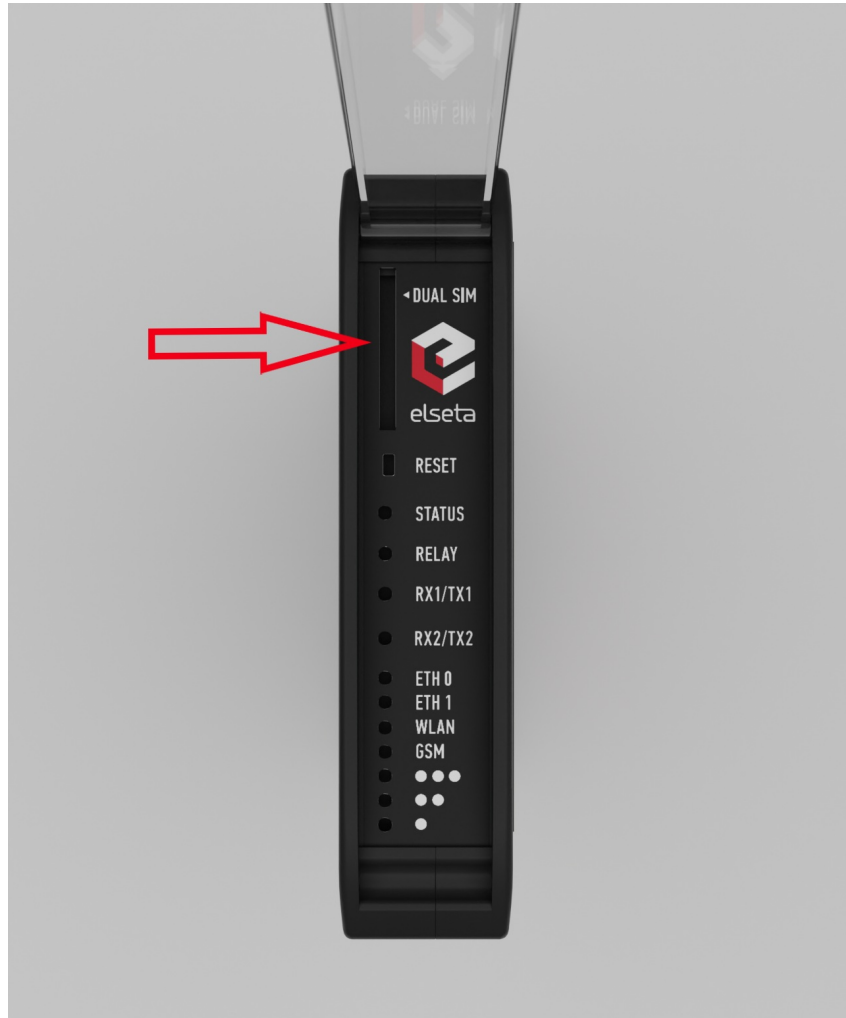
Figure 5: WCC Lite Dual-SIM card slot

WCC Lite has an optional Dual-SIM card modem. To access both SIM cards, remove a transparent front panel cover and press through the marked hole with a small tool until the SIM holder pops out.